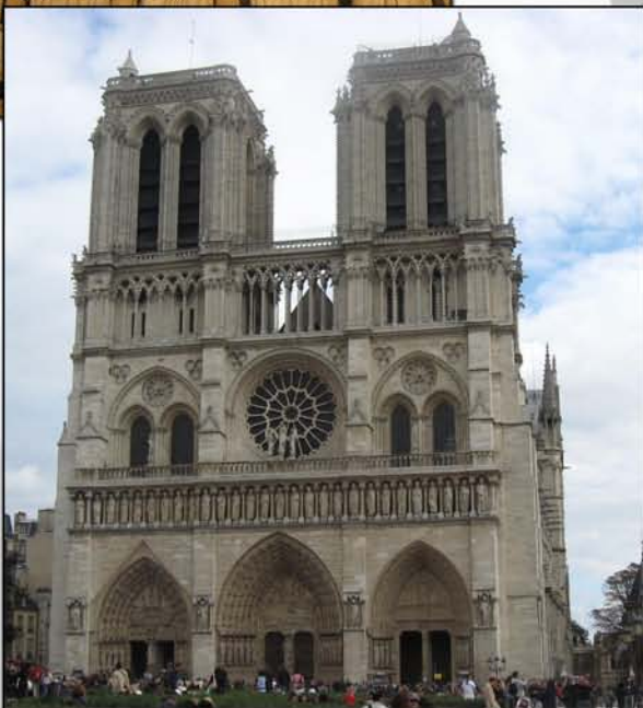
Notre-Dame de Paris