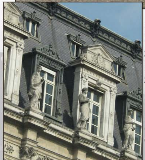
Paris streets and its architecture